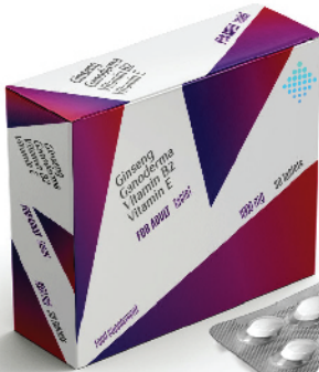
TABLET Ginseng Vit B2, Vit E