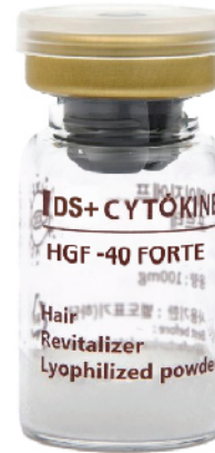
HGF 40 FORTE

11 B Vitamins 19 Amino Acid (Coenzim-A) Minerals (Zn, AHK-Cu, Mg) SOD (Super Oksid Dizmutaz) ATP (Adenosine Tri Phosphate)