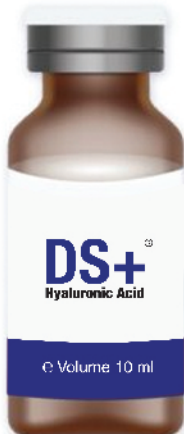
HYARULONIC + COLLAGEN

Azelaic Acid D-Panthenol, Biotin & Pyridoxine and Zinc