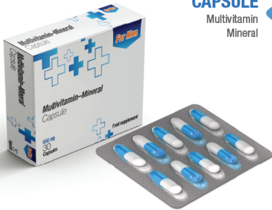
CAPSULE Multivitamin Mineral