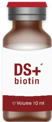
BIOTIN + DUTASTERIDE Patented Biotin

11 B Vitamins 19 Amino Acid (Coenzim-A) Minerals (Zn, AHK-Cu, Mg) SOD (Super Oksid Dizmutaz) ATP (Adenosine Tri Phosphate)