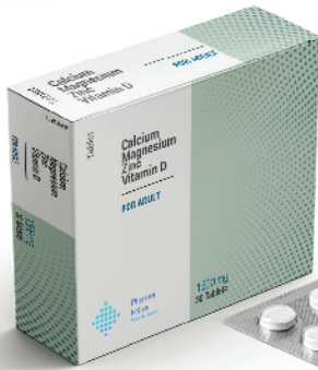
TABLET Calcium Zinc, Vit D