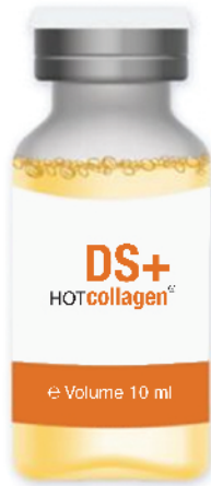
HOT COLLAGEN Silkworm Collagen