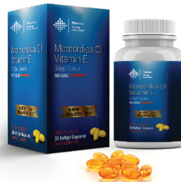
SOFT GEL Momordica Oil Vit E