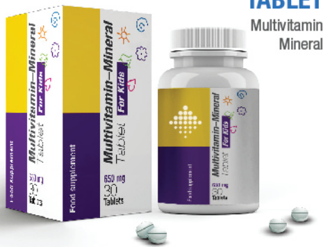
TABLET Multivitamin Mineral