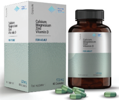
CAPSULE Calcium, Magnesium Zinc, Vit D