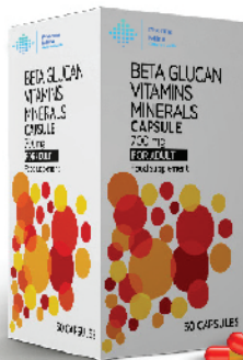
CAPSULE Beta Glucan Vitamins