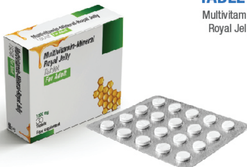
TABLET Multivitamin Royal Jelly